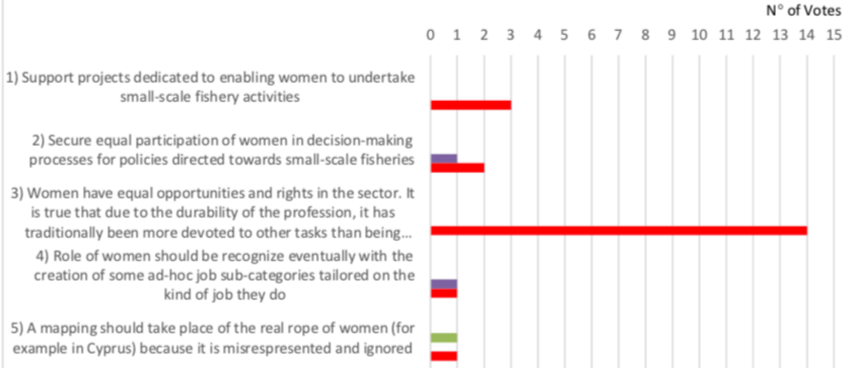
H. Role of women Priority level (1 low - 5 high) ■ 1 ■ 2 ■ 3 ■ 4 ■ 5